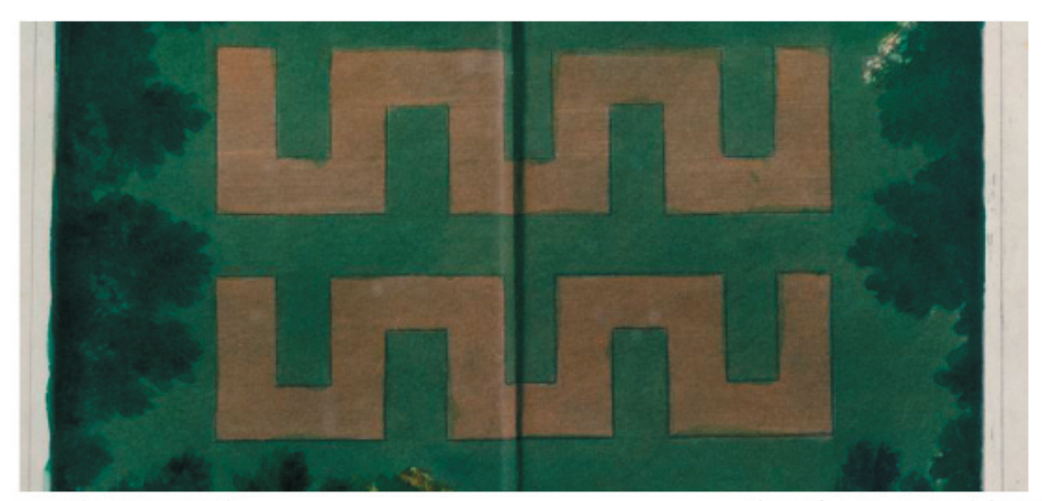
Watercolor, Serpintine Garden